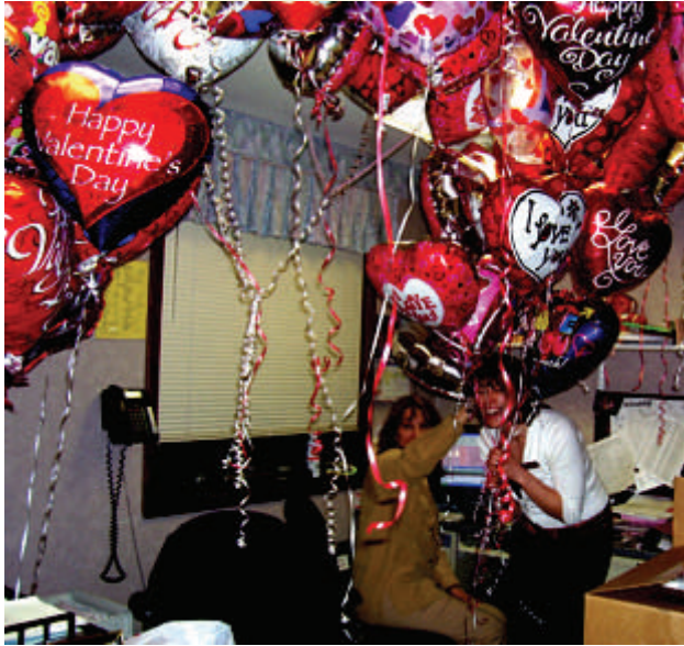
Bridget and Kim having fun making Valentine's Day balloon bouquets!

It is time to order your Valentine's Day balloon bouquets. We will again be selling balloon bouquets for delivery to your loved ones here at Care-Age or for you to pick up for your sweetheart, kids or grandkids. Everyone loves balloons, especially when they come with a cuddly stuffed animal or candy and a personalized card from you! Orders will be appreciated or you can purchase on Valentine's Day, but supplies are limited, so order ahead if you can. Prices range from $5.00 to $10.00, depending on your preference. All proceeds benefit resident activities.